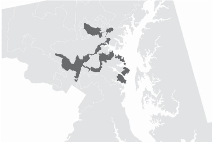
Figure 2. Maryland's Current Third Congressional District ("The Praying Mantis") 109

It is possible to measure any newly drawn district to determine whether or not its boundaries are distorted to the same extent as the original gerrymander. 110 It is a simple calculation—as easy as comparing the perimeter of the original gerrymander to the perimeter of a circle with the same area (because a circle is the most undistorted shape possible, the degree to which a district deviates from a same-sized circle is a measure of the district's distortedness), and then doing the exact same comparison for any other district. 111