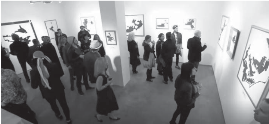
Figure 4. “(Mis)Representations by Gerry Mander” (an art gallery of egregious redistricting on Jon Stewart’s Daily Show) 221

If a Supreme Court precedent invalidating a partisan gerrymander as unconstitutional is going to imbed itself into America’s political culture, and do so quickly (before a future Court has a chance to overrule that precedent), it most likely will attain this cultural status by focusing on the public’s perception of gerrymandering as visually grotesque. 222 If the Court can root the unconstitutionality of gerrymandering in this visual grotesqueness—gerrymandering is unconstitutional precisely because, and to the extent that, it is visually grotesque—then the Court’s holding will make sense to the public and thus come to reflect the public’s own understanding of the Constitution. 223 The Court can achieve this linkage between the gerrymander’s unconstitutionality and its visual grotesqueness through straightforward particularistic reasoning: the original gerrymander was identified as an improper intrusion of partisanship in the drawing of district lines because of its blatantly disfigured shape; 224 and thus, insofar as improper partisanship violates the