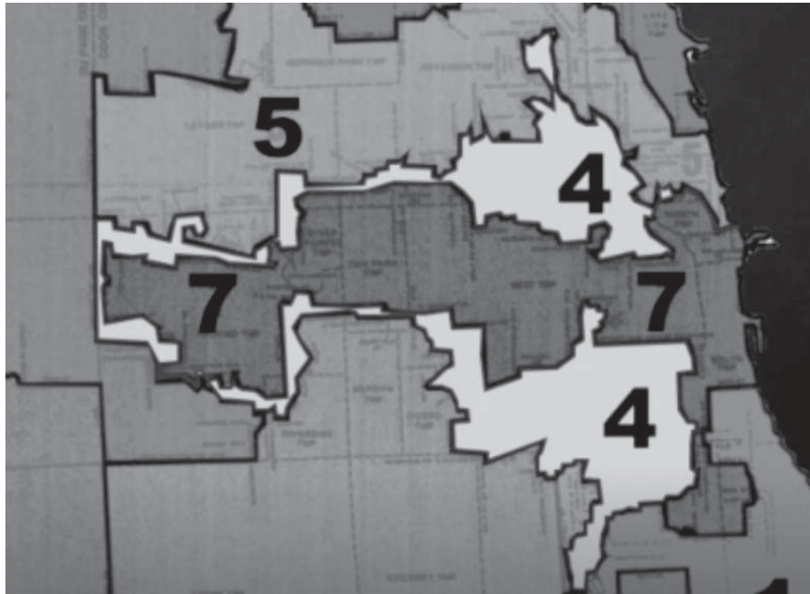
Figure 3. Illinois's Fourth Congressional District (as depicted on Jon Stewart's Daily Show ) 220

The same point is equally true for the contemporary public's perception of what gerrymandering is and why it is so utterly reprehensible. Thus, when Jon Stewart's Daily Show decided to cover the topic of gerrymandering, it did so by lampooning the "art[istry]" necessary to produce such grotesquely distorted congressional districts as Illinois's Fourth. 218 It even concocted a gallery displaying a collection of especially "creative" exercises in redistricting. 219