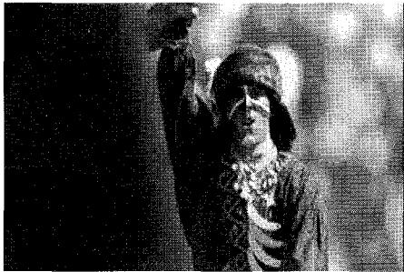
FSU Mascot Osceola 103

With respect to those schools that have the ability to obtain tribe approval, the NCAA has withdrawn its objection, perhaps because of second thoughts about whether the NCAA can reasonably object to practices authorized by the “injured” party, and fueled by threats of litigation. This decision leads to the arguably counter-intuitive result that those schools referencing specific Native American tribes may be free to continue that use while those schools using more generic names like “Braves” are punished because there can be no “permission” granted by a particular tribe. In terms of how the broader community of Native Americans may be perceived as a result of these nicknames or may be offended by the practice, there seems to be little difference between the two.