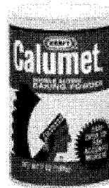
Kraft Calumet Baking Powder 113

Along the same lines, one might also question the NCAA’s discerning concerns with stereotypes. Although only a handful of institutions use Native American names or mascots (out of the NCAA’s membership of over 1,000