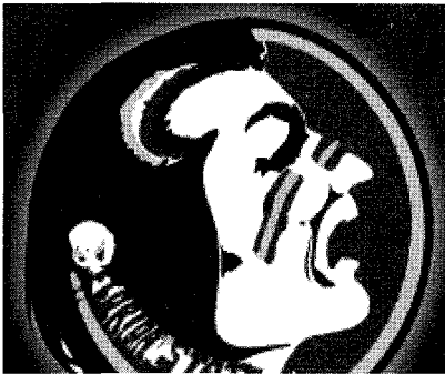
FSU Seminoles Logo

about-face perhaps best illustrates the inconsistencies in the NCAA's current position. In addition to the use of a Native American profile as a logo (see below), the Florida State Seminoles open each football game with a long-standing tradition of the Seminole mascot (a student dressed in Native American garb as Osceola, a nineteenth century Seminole tribal leader 99 ) riding onto the field on an Appaloosa with a flaming lance to thrust into the ground in front of the opposition's sideline. 100 With its highly successful football program, these games are often televised, and the Osceola spectacle can be observed by millions across the nation – few of whom know or care about the University's relationship with the Seminole tribe. Although the Seminole tribe in Florida has formally approved the use of its name, Native Americans across the country decry these theatrics, 101 and, according to the MOIC, there are Seminole members who oppose Florida State's actions. 102 Given the NCAA's conclusion that simply the names "Braves" and "Indians" (or a couple of feathers) are "hostile and abusive" to Native Americans generally, it seems impossible to distinguish the Florida State Seminoles – regardless of the "approval" of one tribe's leadership.