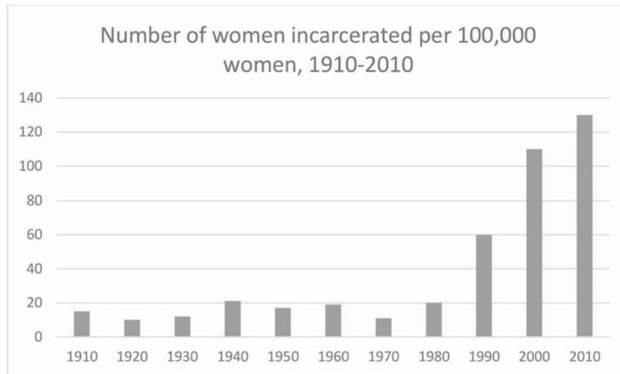
Figure 2. Women's Incarceration Rate in the United States 224

The massive increase in the number of incarcerated women in the United States imposes an enormous tax on society's welfare. Incarceration serves no substantial deterrence function in these cases because the women are often punished for being involved with men who violated the law. The great majority (over 60 percent) of them are incarcerated for nonviolent crimes, 225 and of the women convicted of violent crimes, the vast majority are for simple assaults, mostly against other women with whom they have had some prior relationship. 226 Mass imprisonment of women is especially harmful to society because the incarcerated women are prevented not only from working in the formal job sector, as is true of incarcerated