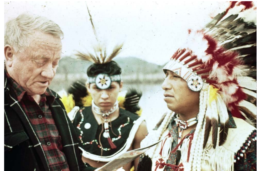
Supreme Court Justice William O. Douglas Meets With Members of the Cherokee Nation Near the Little Tennessee River