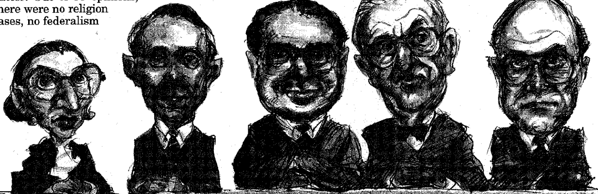
Ruth Bader Ginsburg

That attitude was woven into the Court's biggest constitutional ruling of the term, Clinton v. City of New York , which struck down the line-item veto, he says.