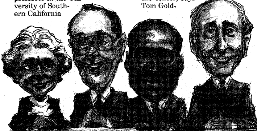
Sandra Day O'Connor

But Chemerinsky asks who qualifies as a supervisor? What policies are sufficient? He and others will watch the legal developments at the same time they await the next blockbuster constitutional case. The last term could simply be the calm before the storm. ■