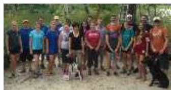
Members of SEALS on a hike with their pets.

As citizen lawyers, community service stands as one of the great traditions of the William & Mary