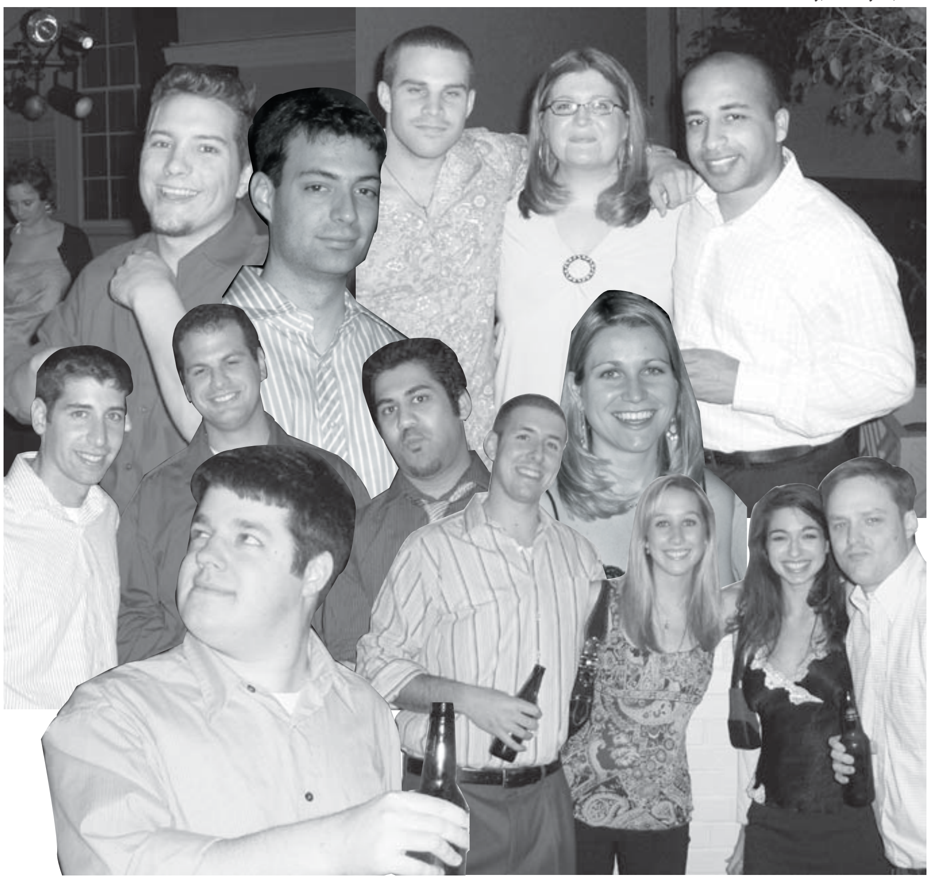
3Ls and Alumni danced the night away at the 100 Nights Celebration on Friday, February 3.