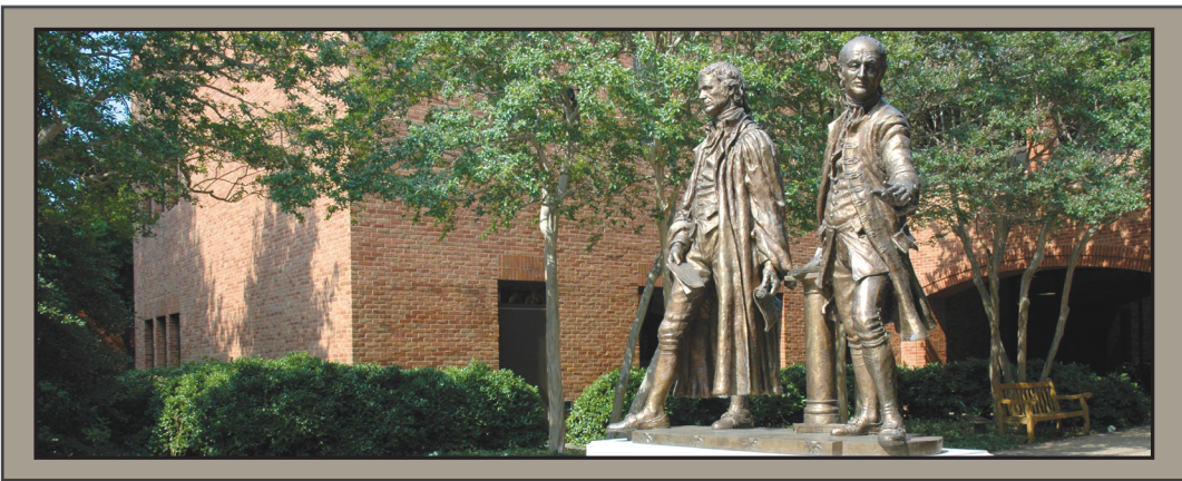
Statues in front of William & Mary Law School

George Wythe, at right, was William & Mary's - and the nation's - first professor of law. Chief Justice John Marshall, at left, was among the earliest law students at William & Mary.