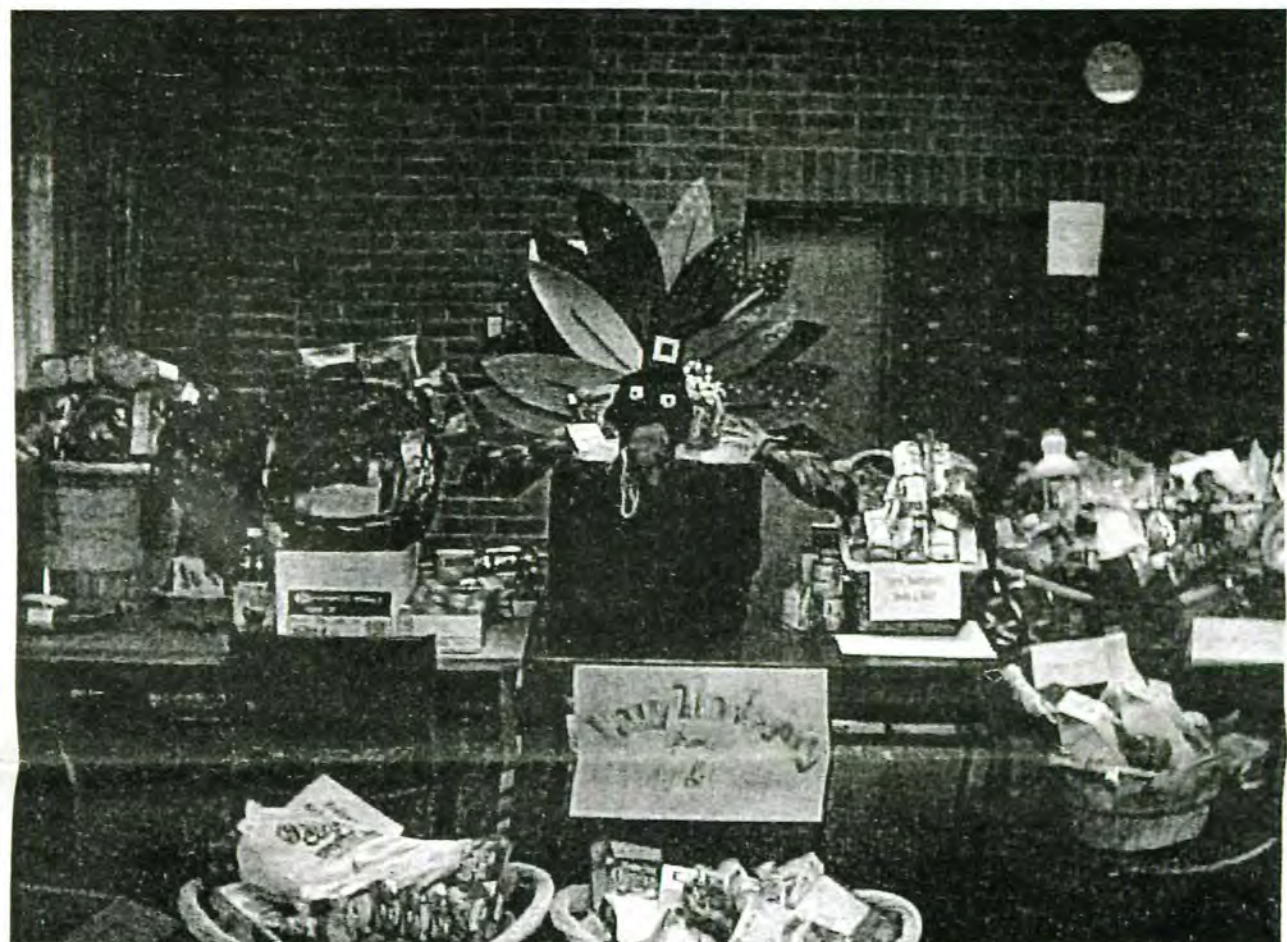
Tarley & Flanigan's turkey basket (center) won first place in the Black Law Student Association's Thanksgiving day charity contest.