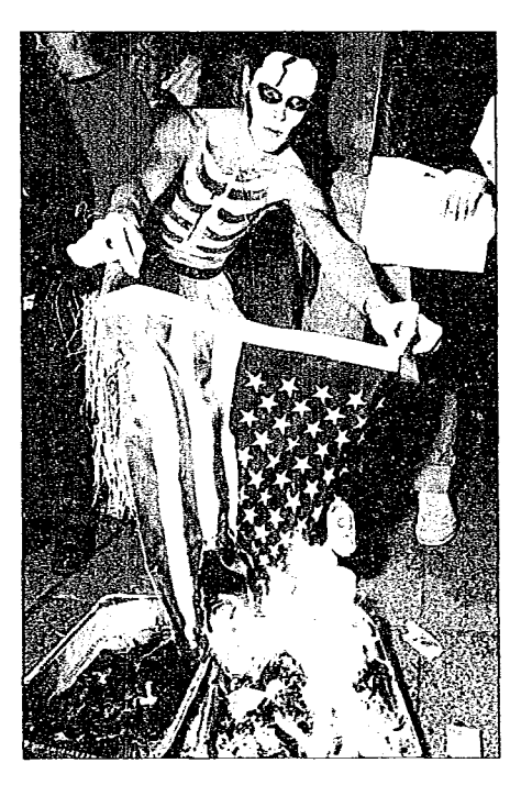
Burning the flag in Seattle.