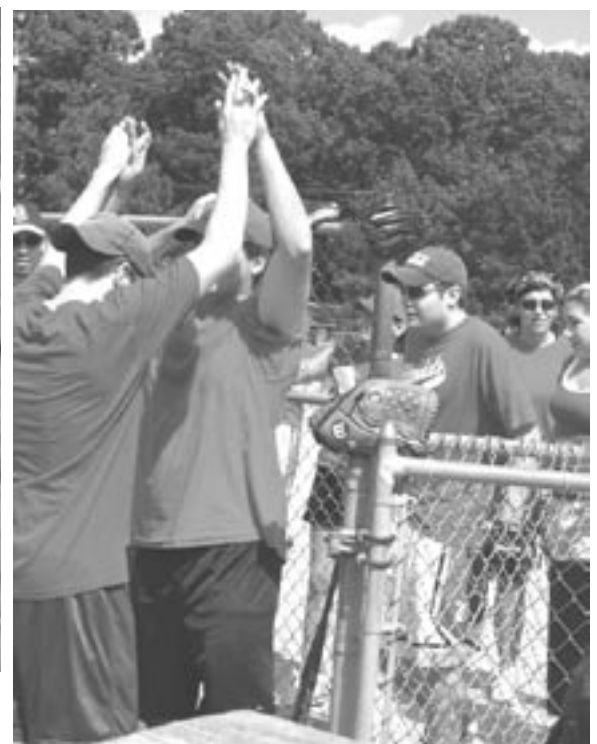
Members of Shake 'n Bake celebrate a run.