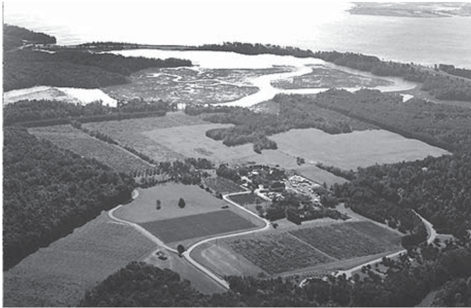
An ariel view of the Williamsburg Winery.

The tour then moved downstairs, past doors that automatically swung shut using a system of weighted ropes rather than modern hydraulics, into the barrel cellar, where wine is aged using traditional oak casks. The casks, said John, are only suitable for winemaking for six or seven years, after which they are cleaned and sold. It is up to the individual consumer to find a use for them, he said, but he