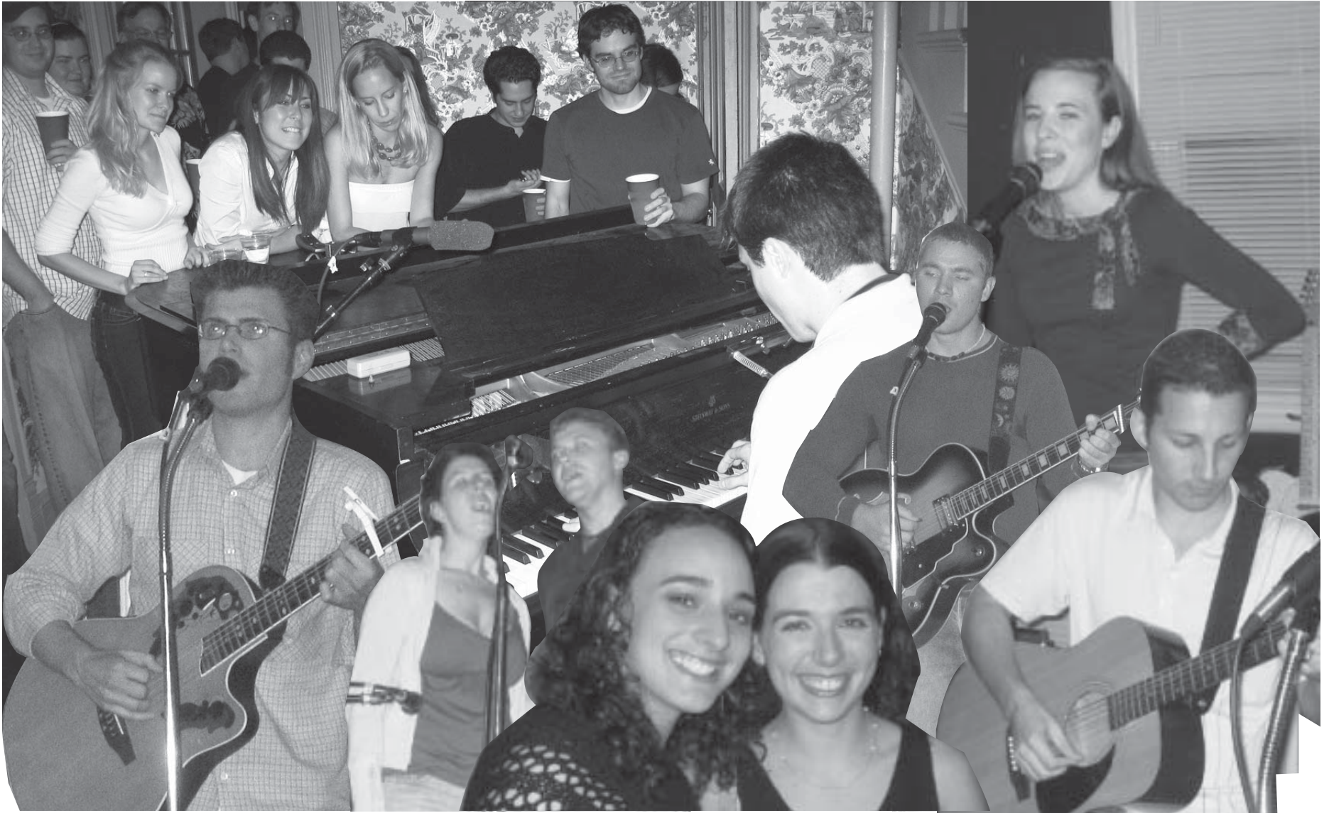
Marshall-Wythe students wow their classmates at the Singer/Songwriter showcase.