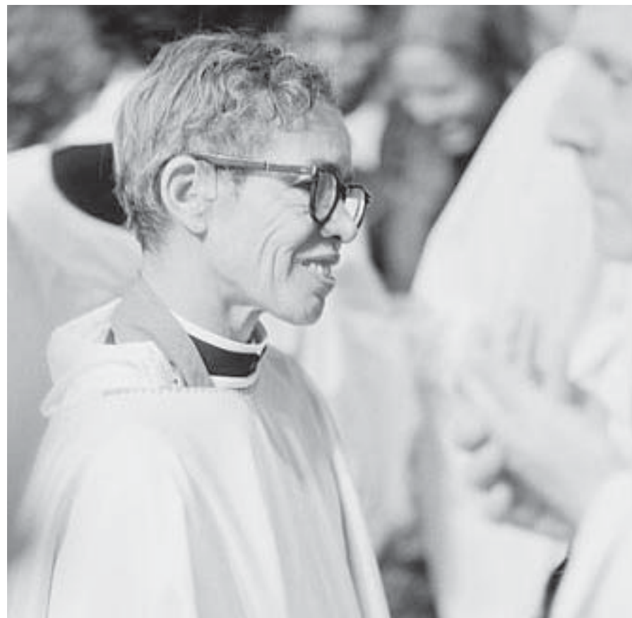
Pauli Murray, age 67, at her ordination in 1977.

After she unsuccessfully tried to get into Harvard Law School she attended Berkeley Law School to pursue an LL.M. This was the first time she experienced "Jane Crow", exclusion based on her gender. Despite letters from Franklin D. Roosevelt, written on the insistence