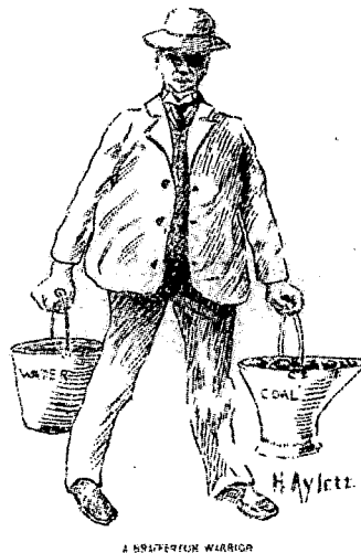
A BRAFFERTON WARRIOR

Mockery is apparent in the title, recalling the Indian School, to a sketch of one of the workers in the Brafferton, "A Brafferton Warrior." 120