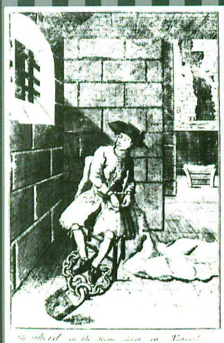
the subject in the stone prison in Venice.