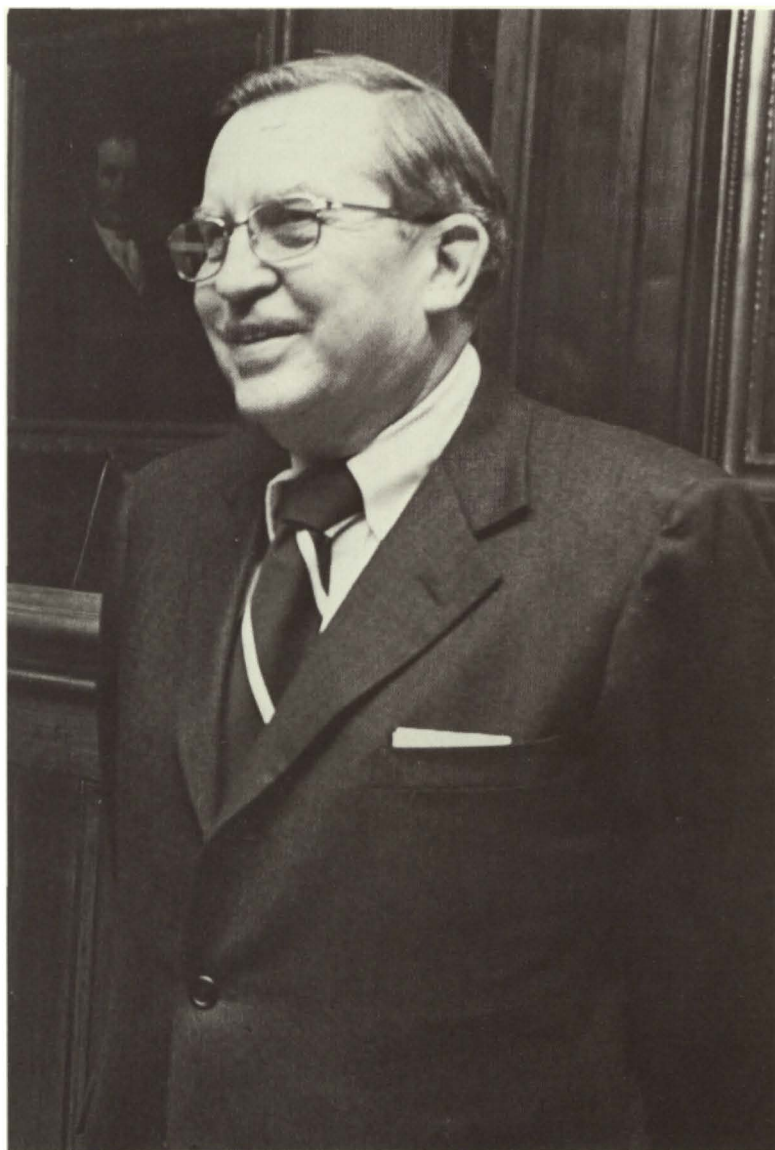
Dean William B. Spong, Jr.