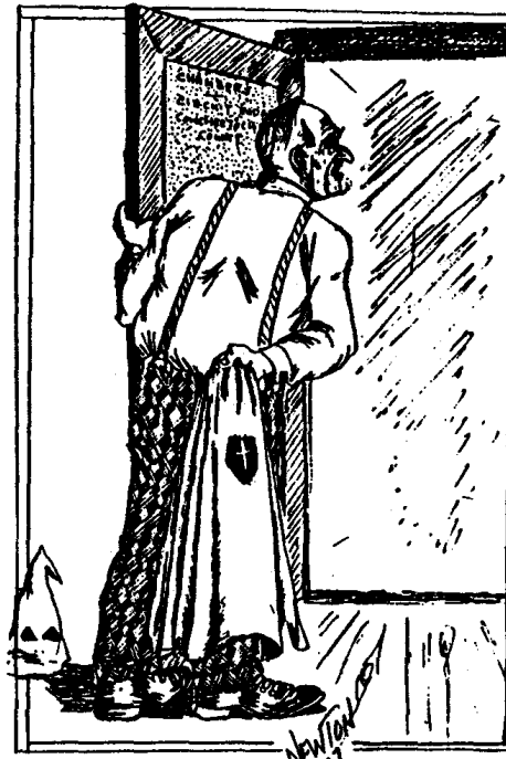
"Clerk—tell 'em court's gonna be delayed 'til my wife can get here with the proper robes!"

A weekend move for the Tax Library, and a final step of moving the stack materials, were next on schedule as this issue went to press.