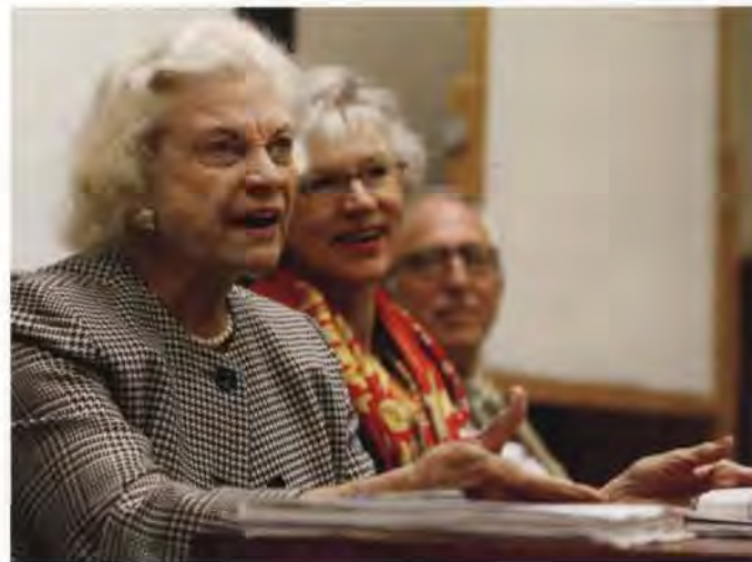
William & Mary Chancellor and former U.S. Supreme Court Justice Sandra Day O'Connor, at left, Chief Justice of Canada Beverley McLachlin, and U.S. District Court Judge Charles R. Breyer were among the American and Canadian judges who engaged in a dialogue with students during a panel at the Law School in April 2007.

their first week on campus in an intense introduction to Legal Skills and then continue for two years with both classroom instruction and simulated client representation. Each student joins a law office led by a senior partner drawn from the faculty and a junior partner chosen carefully from among third-year students. Within the law office and in the context of specific cases, much happens: research, counseling, interviewing, drafting all sorts of legal