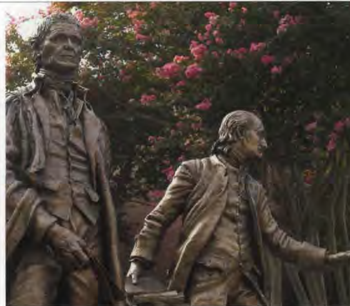
Statues of George Wythe and John Marshall stand together before the Law School, commemorating its historic origins. In 1779, at Thomas Jefferson's urging, Wythe (right) was appointed as William & Mary's — and America's — first professor of law. John Marshall (left), who served as the fourth Chief Justice of the U.S. Supreme Court, was among the earliest law students at William & Mary, receiving his formal legal training under Wythe's tutelage.

Members of our faculty teach with real passion in and out of the classroom. They contribute meaningfully to scholarship. They study the role of law in