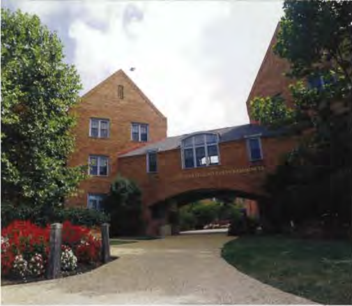
The Lettie Pate Whitehead Evans Residences are adjacent to the Law School.

Thrill-seekers will enjoy braving the roller coasters at Busch Gardens or riding the waves at Water Country USA, while the more laid-back may prefer sipping a choice vintage on the local winery's outdoor patio.