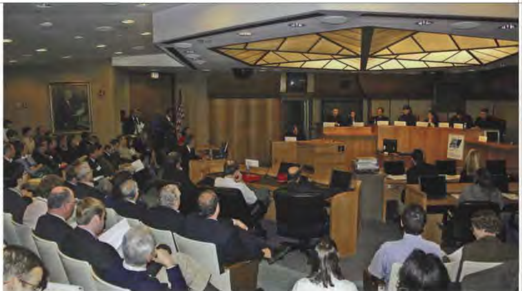
Each fall, the Supreme Court Preview, sponsored by the Institute of Bill of Rights Law, brings together leading journalists, advocates, and scholars to discuss the court's upcoming term.

The McGlothlin Courtroom can accommodate almost any technology a judge or lawyer might want, whether it is electronic filing, hotlinked motions and briefs, a multi-media court record, remote judicial or witness appearances through videoconferencing,