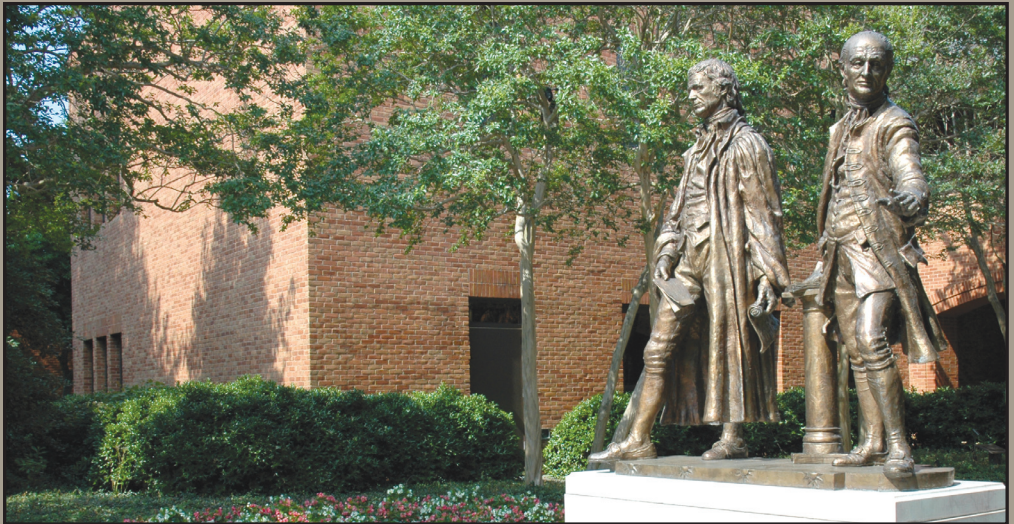
Statues in front of William & Mary Law School

George Wythe, at right, was William & Mary's - and the nation's - first professor of law. Chief Justice John Marshall, at left, was among the earliest law students at William & Mary.